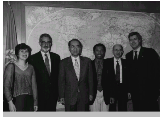
Pax Romana Team met Koichiro Matsuura, Director General of UNESCO, Paris, March 2001

Our religious identity with the Gospel and its rich Catholic Social Teaching gives our representation a strong moral and ethical base for what we can advocate for peace and justice. In New York, we work very closely with the other Catholic NGOs including many religious communities such as Franciscans International, who have a number of full time representatives. We are very active in the International Catholic Organisation Information Centre, where I serve on the board of Directors. Many of the Catholic NGO representatives, including myself look at this work as a ministry of advocacy. It is a ministry that has a very important role in the UN system in promoting peace and justice with the Catholic NGO community which is very highly respected. Our identity has also called us to get involved in inter-religious dialogue with other religious NGOs at the UN.